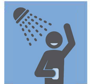
PRACTICE GOOD HYGIENE HABITS