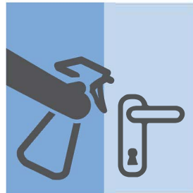
CLEAN AND DISINFECT "HIGH-TOUCH" SURFACES OFTEN