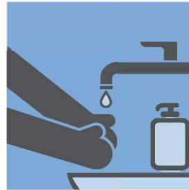
WASH HANDS OFTEN WITH WATER AND SOAP (20 SECONDS OR LONGER)