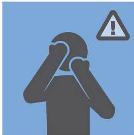
AVOID TOUCHING YOUR EYES, NOSE, OR MOUTH WITH UNWASHED HANDS OR AFTER TOUCHING SURFACES