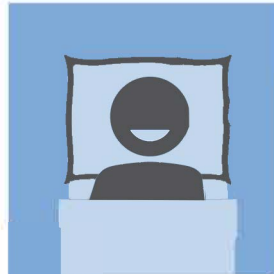
GET ADEQUATE SLEEP AND EAT WELL-BALANCED MEALS