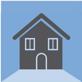
STAY HOME WHEN YOU ARE SICK