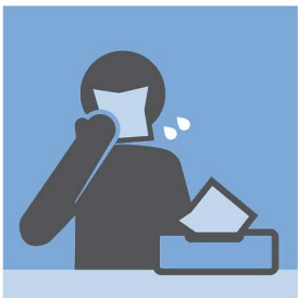
COVER YOUR MOUTH WITH A TISSUE OR SLEEVE WHEN COUGHING OR SNEEZING