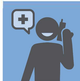
CALL BEFORE VISITING YOUR DOCTOR